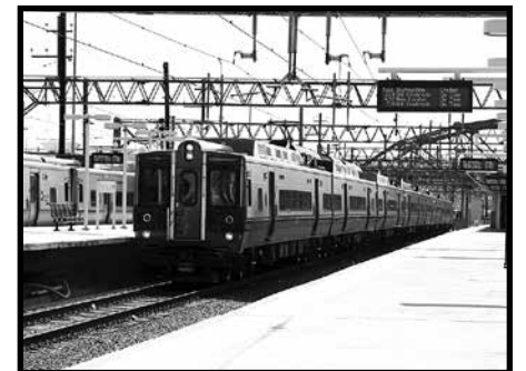
MU Train at New Haven, CT