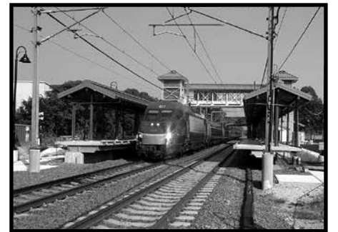
Train 137 at Westbrook, CT