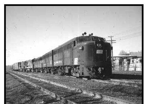
PC freight at Hartford, CT