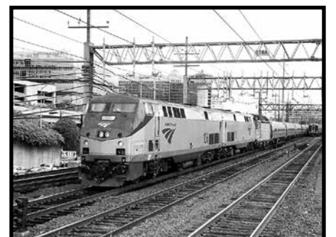
Diesel helpers at Stamford, CT