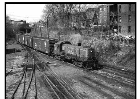
Local freight at Hartford, CT