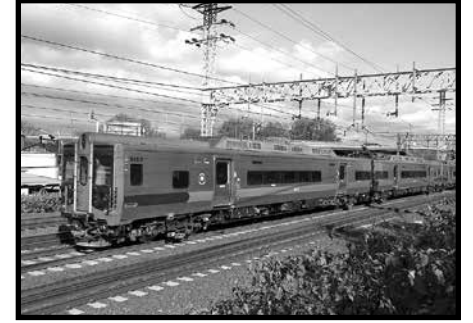
MU Train at West Haven, CT