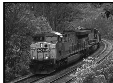
Climbing through the Berkshires