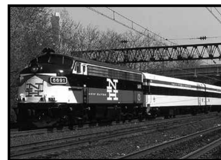
Ribbon Cutting Train at New Haven