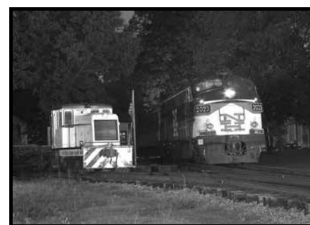
A Night at the Museum Willimantic