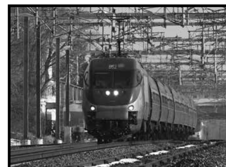
A High Roller leaves Old Saybrook