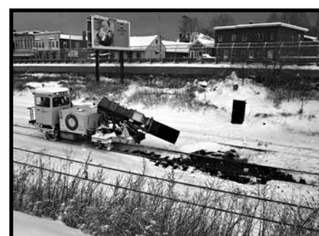
Snow Blowing at Palmer