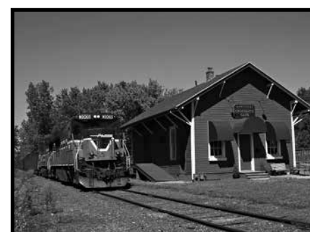
Stopping for Chocolates at Wehthersfield